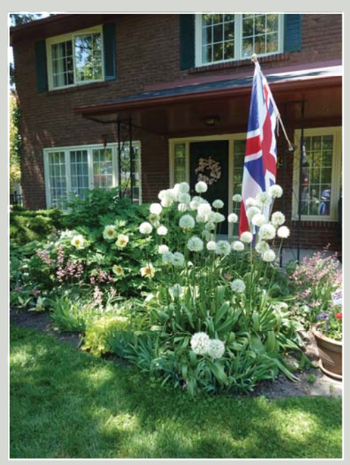
The Hayward Garden