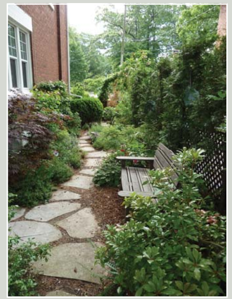
The Taylor Garden